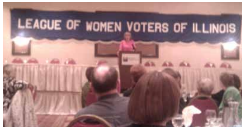
The LWVEA delegates at the LWVIL Annual Meeting in June.

There were a variety of educational sessions and excellent opportunities to learn League “best practices” from other chapters across the state.